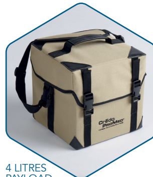
4 LITRES PAYLOAD