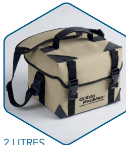
2 LITRES PAYLOAD