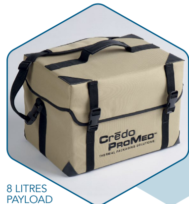
8 LITRES PAYLOAD